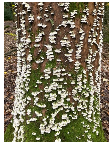
Which fungi are these?