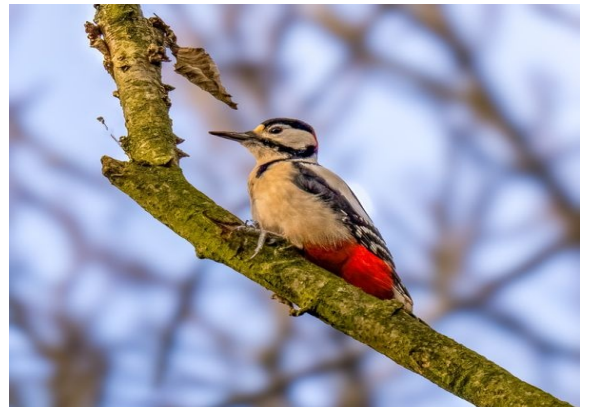
Greater spotted woodpecker 20 th January