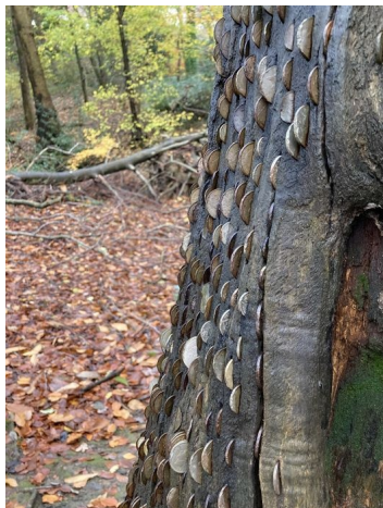
A coin tree . Not to be encouraged