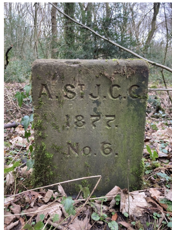
St John's Parish boundary marker